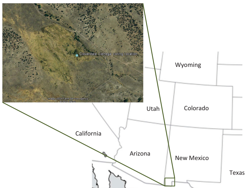
Fig. 1. Location map for Cloverdale Ciénega.